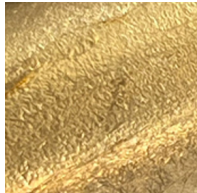
Gold Leaf - GLF